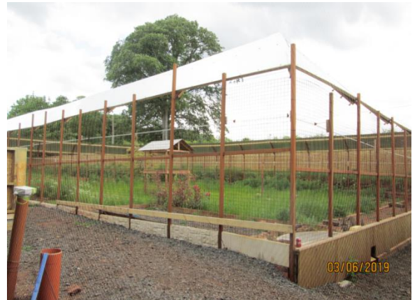
West and south elevation of enclosure.