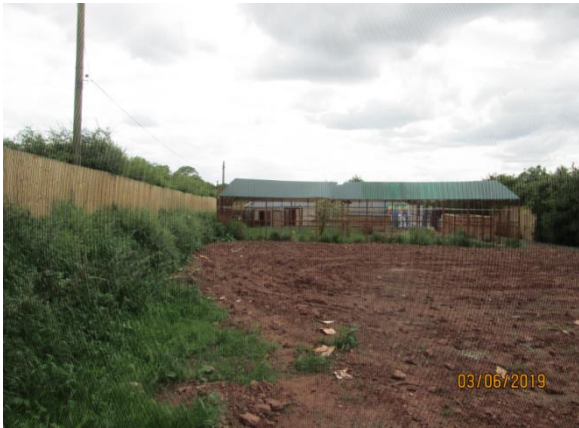
Photo taken from the north of the site looking at the enclosure.