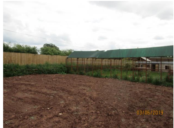
Relationship between enclosure and east boundary of site.