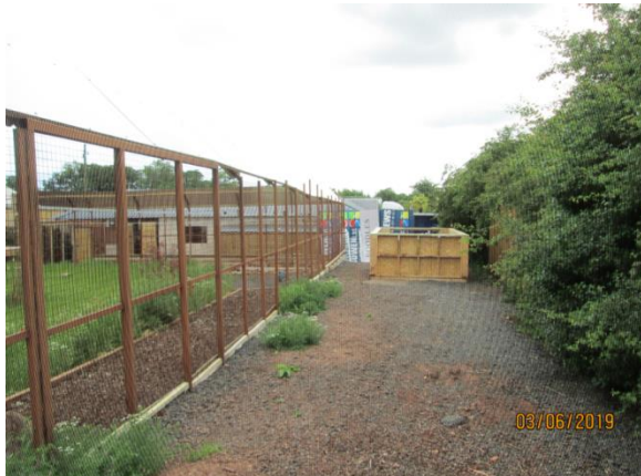
West elevation of enclosure.